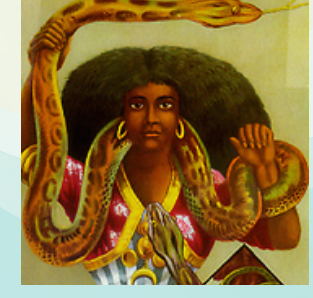
A painting of Mami Wata . Mami Wata is a water deity that can be found in religions and folklores across Africa and in the Caribbean. Her name reflects her status as "Mother of Water."