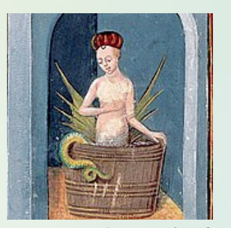
A painting of a Melusine , a figure in many European folklores. She can be found waiting in sacred springs or in rivers.