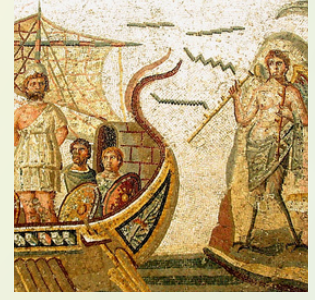
A mosaic of the Greek hero Odysseus meeting a siren . The Greeks originally described sirens as being part bird. Sirens were later described as half fish creatures or fully human in appearance.