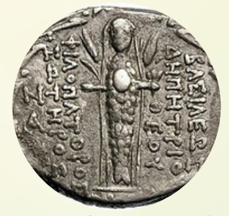
A coin featuring the ancient Syrian goddess Atargatis , who is represented as a figure with the head of a woman and the body of a fish.