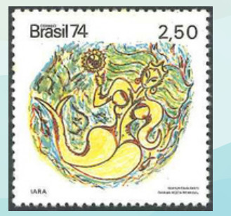
This stamp depicts Iara , a character from Brazilian folklore. She has green hair and the upper torso of a beautiful woman, and the tail of a river dolphin.