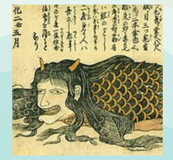
In Japanese folklore, the flesh of a Ningyo , a fish with the head of a human, could bestow long life on those who consumed it.